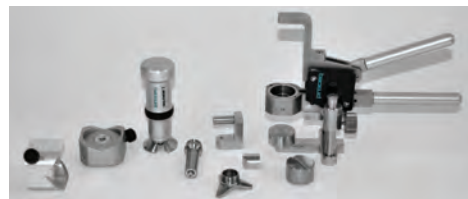
Adaptors for different applications