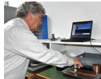
Equostat 3 probe connected to PC