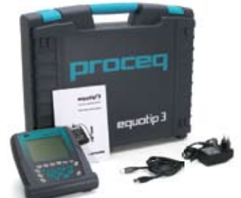
353 10 050 basic unit