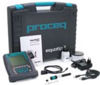
353 10 100 unit D

Equotip3 indicating device, AC adapter, carrying case, USB-cable, USB-memory stick, operating instructions and quick reference guide. The customer needs to buy the appropriate impact device and test block in addition to the Equotip 3 basic unit