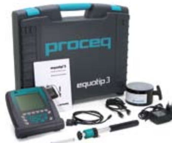
353 10 300 unit G